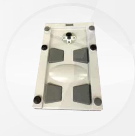
■ Motorized Foot Switch