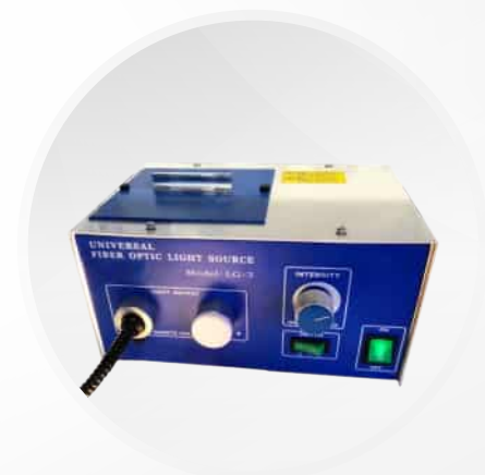
■ Universal Fiber Optic Light Source